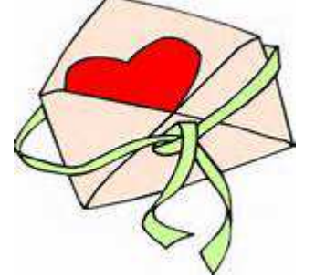
One pretty valentine left all alone [Child's name] bought that valentine, and all were gone.

Two pretty valentines standing side by side, [Child's name] bought one, and then there was one.